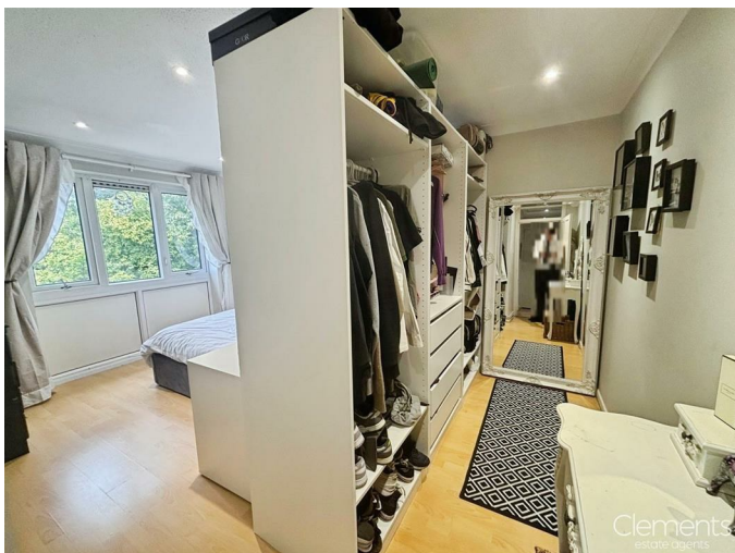
Bedroom One 14'3 x 9'10 (4.34m x 3.00m)

Wall and base units with work surfaces to compliment, electric oven, electric hob and cooker hood over, stainless steel sink with drainer, tiled splash backs, central heating boiler, pantry and double glazed window.