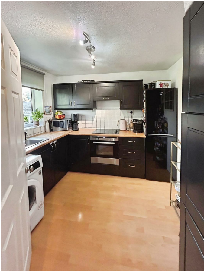
Kitchen 9'0 x 8'7 (2.74m x 2.62m)

Wall and base units with work surfaces to compliment, electric oven, electric hob and cooker hood over, stainless steel sink with drainer, tiled splash backs, central heating boiler, pantry and double glazed window.